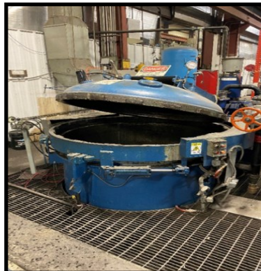
Vacuum Pressure Impregnation