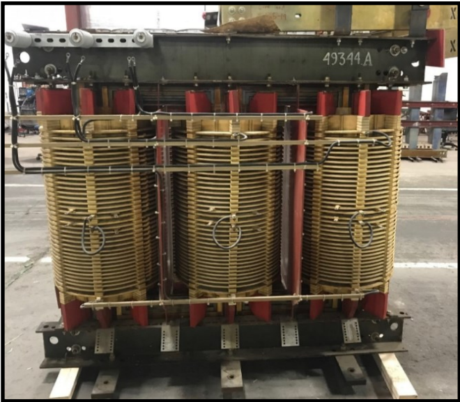
Old Failed Unit

Who is this beneficial service for? Universities Hospitals Historic Buildings Customers who want quick turnaround