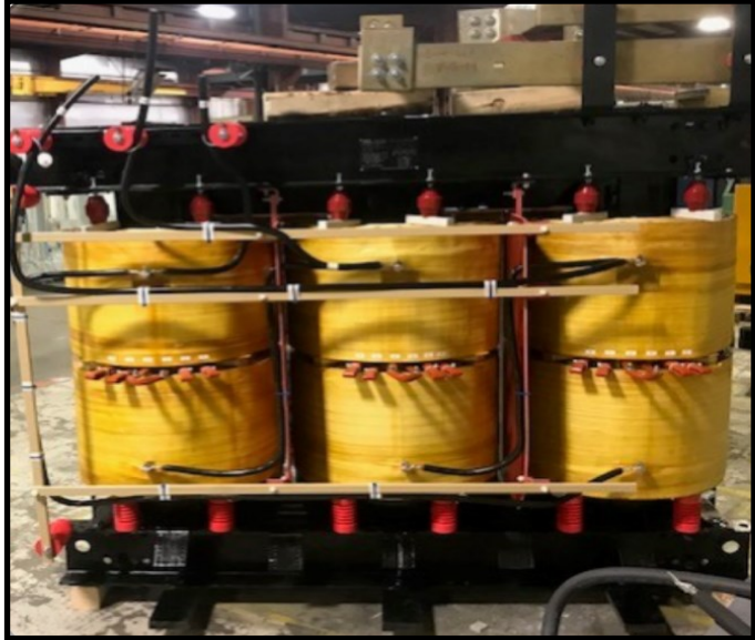
Newly Rebuilt Unit